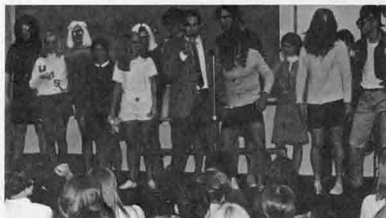
Lending beauty to the Steamers pep rally on November 27 were these lovely cheerleaders.